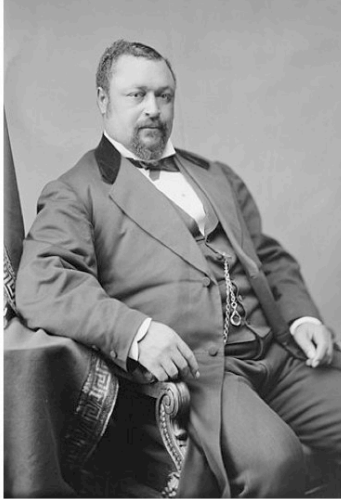
Blanche Bruce U.S. Senator Mississippi 1875-1881

During Reconstruction, thousands of African Americans were elected to local and state governments throughout the Southern states. In addition, 17 African Americans were elected to the United States Congress from Southern states between 1870 and 1877. Here are photographs of 6 of these 17 elected officials.