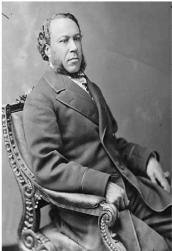
Joseph Rainey U.S. Representative South Carolina 1870-1879