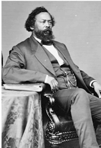
Benjamin Turner U.S. Representative Alabama 1871-1873