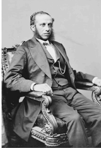
Robert DeLarge U.S. Representative South Carolina 1871-1873